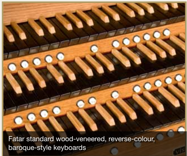
Fatar standard wood-veneered, reverse-colour, baroque-style keyboards