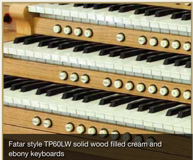
Fatar style TP60LW solid wood filled cream and ebony keyboards