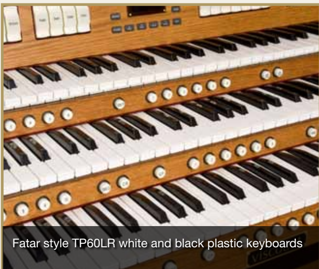
Fatar style TP60LR white and black plastic keyboards