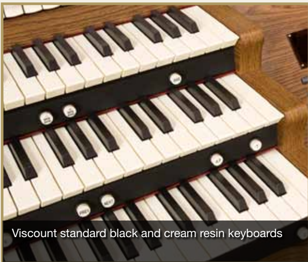
Viscount standard black and cream resin keyboards