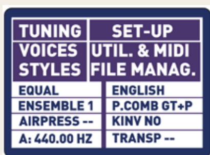
Initial instrument display

A comprehensive range of instrument management is available to the player without the need for a computer link up. The features are controlled through a display that can be readily seen at the console.